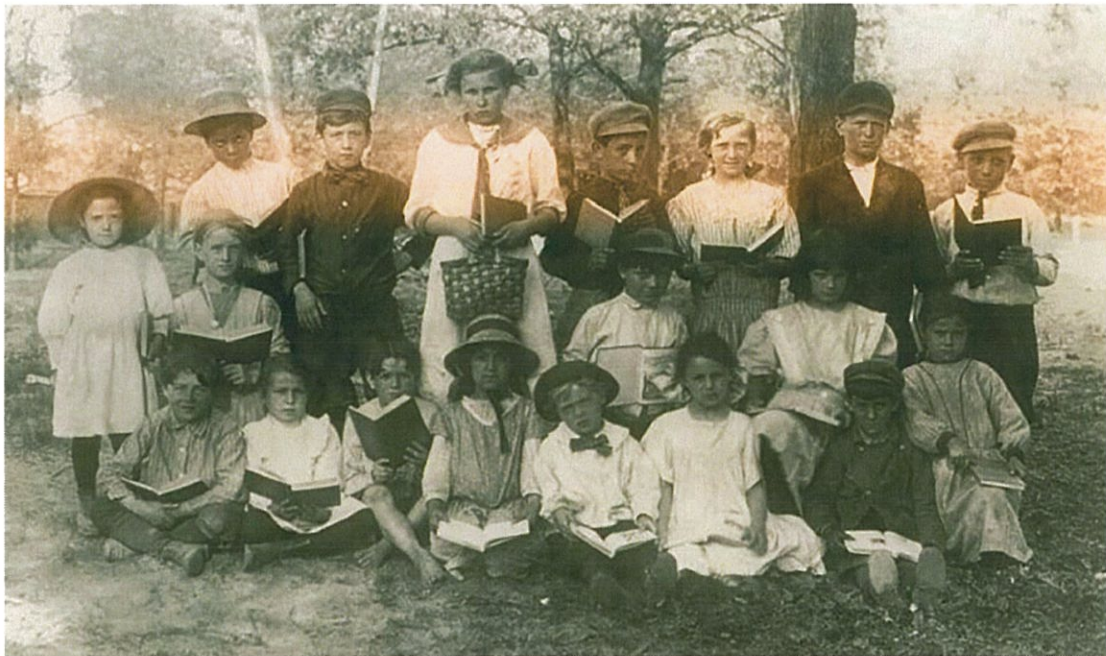
A group of schoolchildren in Gary, Indiana, in the late nineteenth century. Some of the children are immigrants, and others were born in the United States. The immigrants in this photo came to the United States from many places including Greece, Poland, Italy, Russia, Ireland, and Spain.

Immigrants from this new wave often lived and worked in ethnic enclaves—close-knit communities within major cities of people from the same ethnic background seeking economic opportunities. Enclaves of Italians, Poles, Jews, Chinese, Greeks, and other ethnic groups peppered U.S. urban centers. Immigrants lived in ethnic enclaves for a number of reasons. Enclaves formed around areas where housing was available to immigrants, but also because of proximity to work, stores with familiar goods, and churches. Immigrants